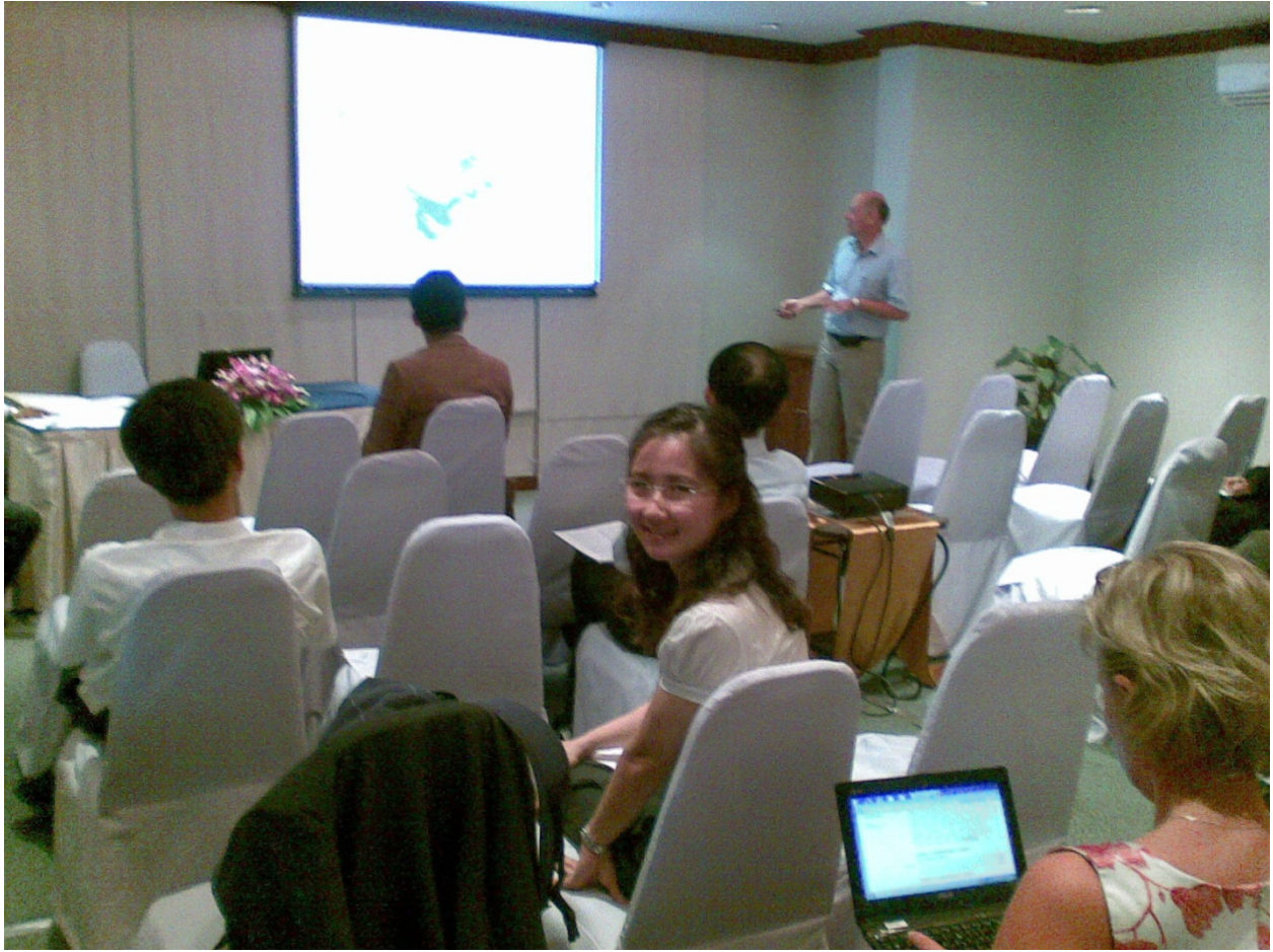
Figure 4. At the conference room